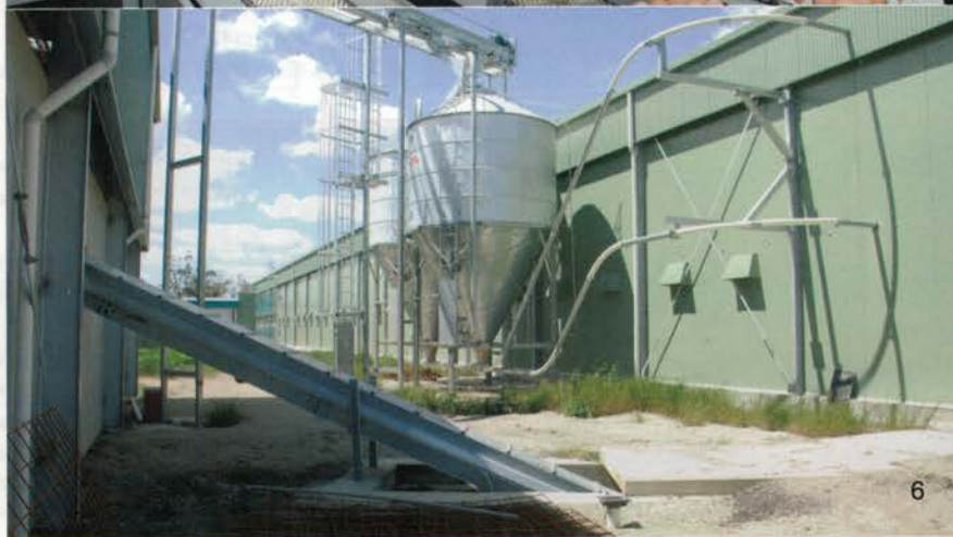
1. Dust, odour, noise reducing chimney design containing main fan area. 2. Serious Perkins powered 450 KVA generator. 3. Andrew sets the Hotraco shed climate control system. 4. Lower four tiers of Valli cage system and cool pad. 5. Grader and packing rook Moba system. 6. New shed exterior with manure belt left of picture.