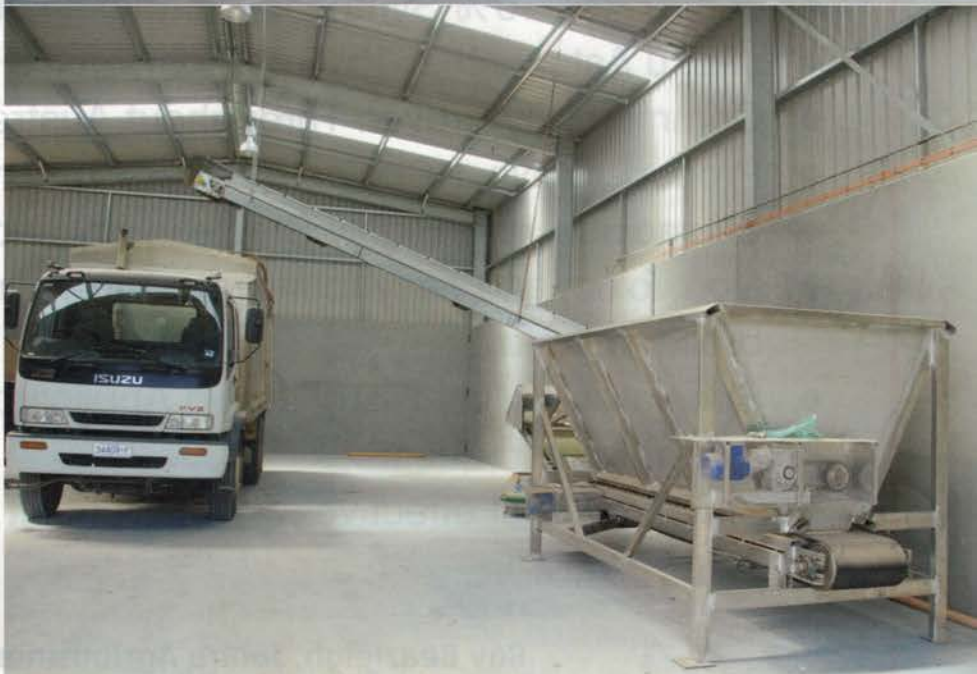
Top: New retail/office complex easily accessible from the busy Dandenong-Frankston road. Centre: Plenty of rain water storage capacity. Above: Neat manure handling system makes removal and transport of a valuable asset easy.