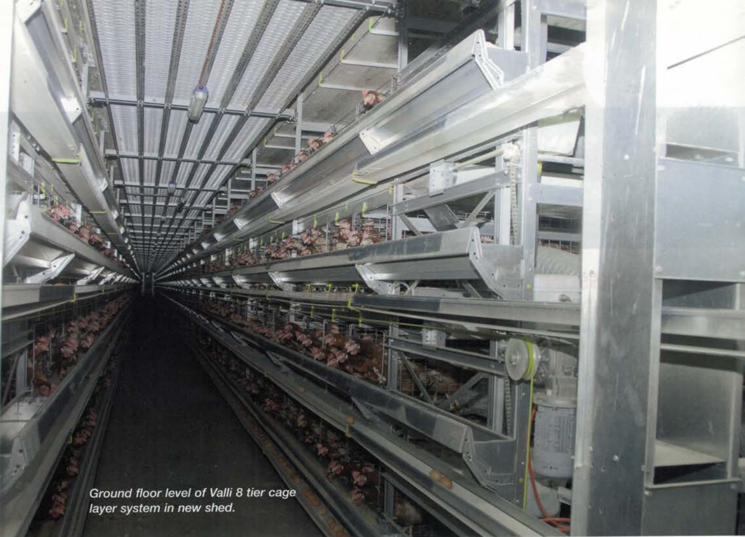
Ground floor level of Valli 8 tier cage layer system in new shed.